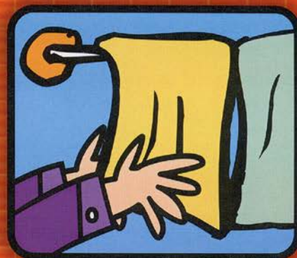
Dry your hands