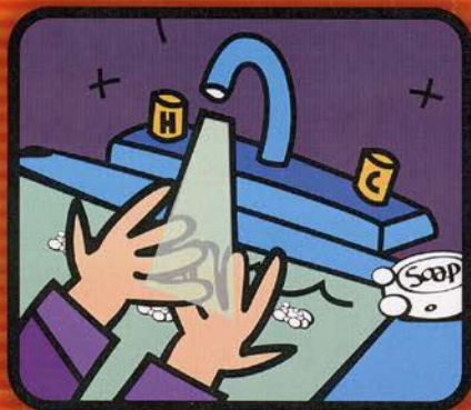
Rinse your hands