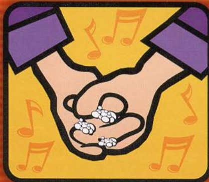
Rub hands together