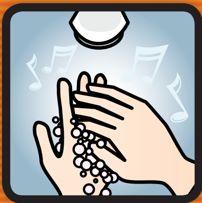
3. Zaminaan gininjiin