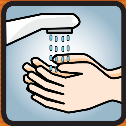
1. Shagobadon gininjiin