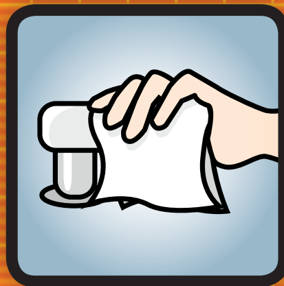
6. Giibaan akina nibe mazinegaan