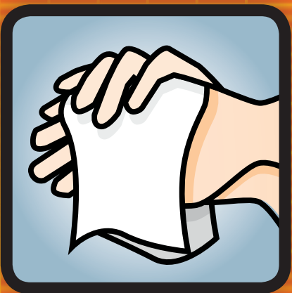
5. Pasaan gininjiin